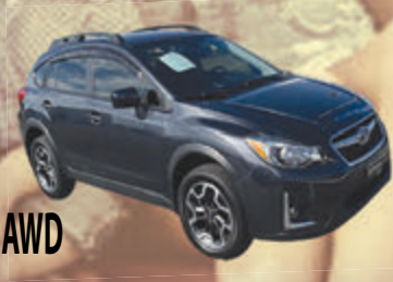
2016 SUBARU CROSSTREK