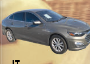
2020 CHEVY MALIBU