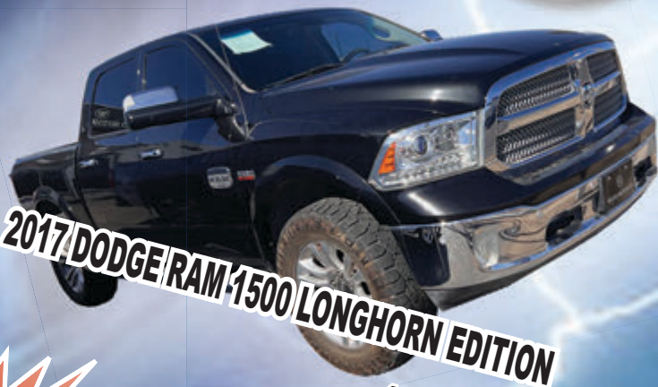
2017 DODGE RAM 1500 LONGHORN EDITION 4x4 • 5.7 HEMI