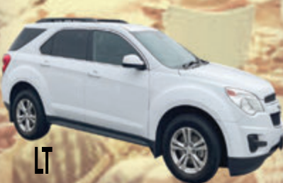
2015 CHEVY EQUINOX