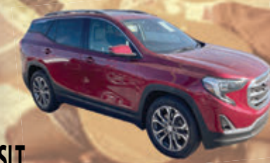
2018 GMC TERRAIN