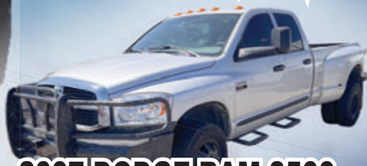
2007 DODGE RAM 3500 Dually • 4x4 • 6.7 Diesel

100 SERVICE TRUCK Crane, Compressor, Gas Welding Set-Up