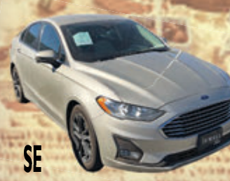
2019 FORD FUSION