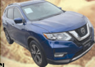
2018 NISSAN ROGUE