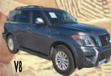
2018 NISSAN ARMADA