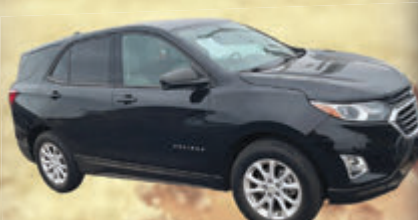
2019 CHEVY EQUINOX