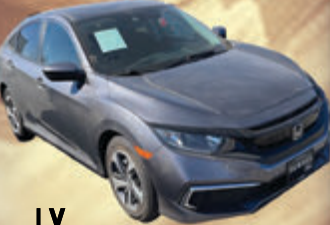
2019 HONDA CIVIC