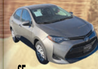
2018 TOYOTA COROLLA