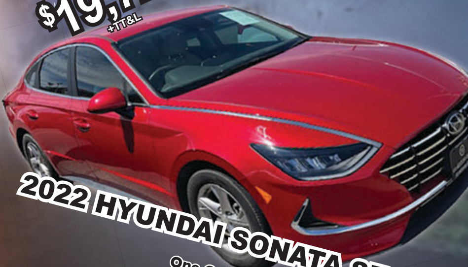
2022 HYUNDAI SONATA SE One Owner Car! Only 31K Miles Come Grab This One Today!