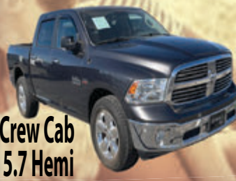
2017 DODGE RAM 1500