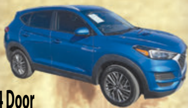
2020 HYUNDAI TUCSON

2430 East 8th Street Odessa, Texas 79761 (432) 444-7190