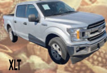
2019 FORD F150 CREW CAB