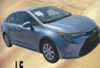
2021 TOYOTA COROLLA