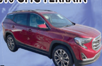
2018 GMC TERRAIN