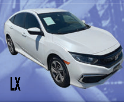
2021 HONDA CIVIC