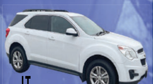
2015 CHEVY EQUINOX