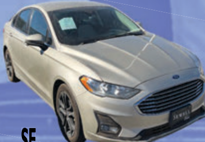
2019 FORD FUSION