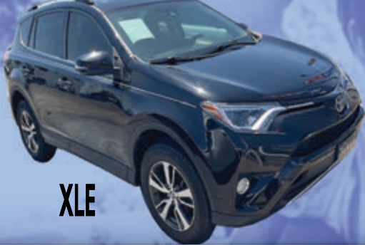
2017 TOYOTA RAV4