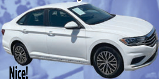
2020 2021 VW JETTA