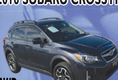
2016 SUBARU CROSSTREK