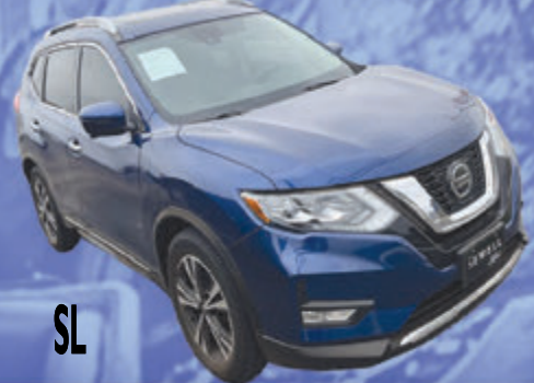
2018 NISSAN ROGUE