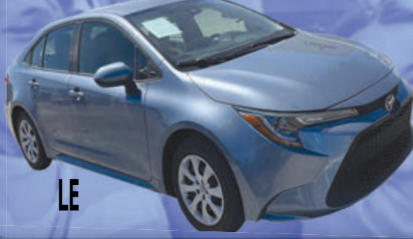
2021 TOYOTA COROLLA