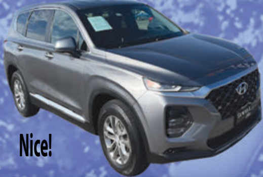
2020 HYUNDAI SANTA FE

2430 East 8th Street Odessa, Texas 79761 (432) 444-7190