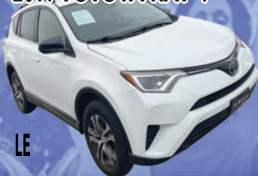
2017 TOYOTA RAV4