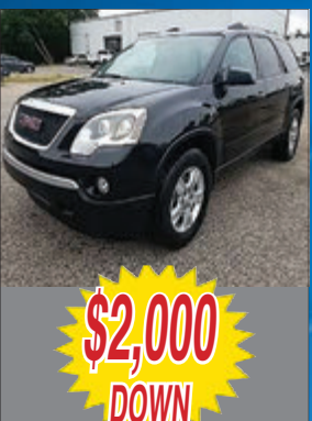
2012 GMC ACADIA