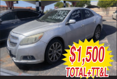
2013 CHEVY MALIBU

OPEN MONDAY - THURSDAY 1:00pm - 6:00pm 432-262-0496