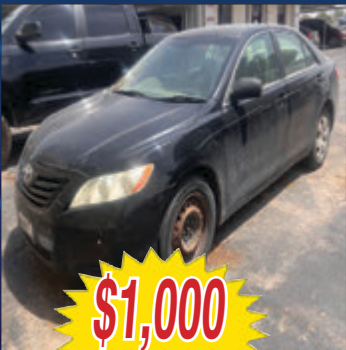
2009 TOYOTA CAMRY