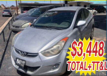
2013 HYUNDAI ELANTRA