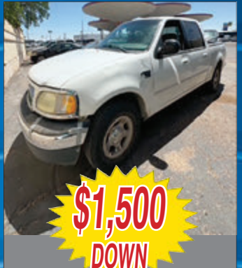
2001 FORD F150