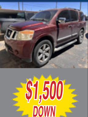
2011 NISSAN ARMADA