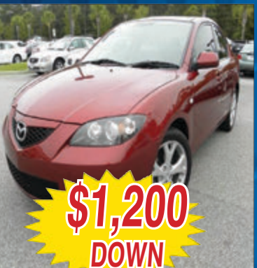
2008 MAZDA 3