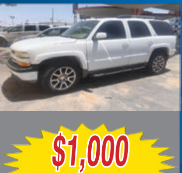
2004 CHEVY TAHOE Z71 4X4