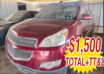
2011 CHEVY TRAVERSE