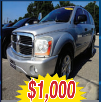
2004 DODGE DURANGO