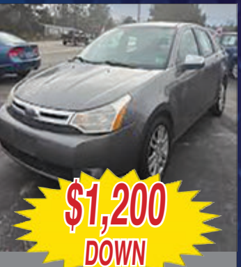
2010 FORD FOCUS