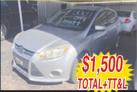
2013 FORD FOCUS