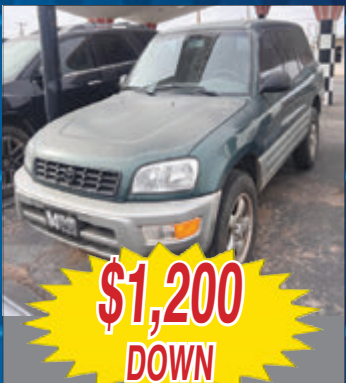
1998 TOYOTA RAV4