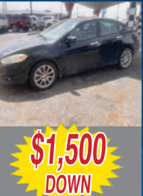
2013 DODGE DART