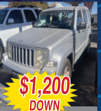
2012 JEEP LIBERTY