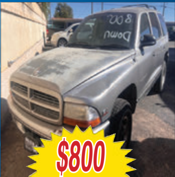
1999 DODGE DURANGO