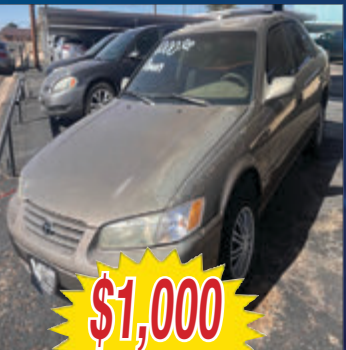
1999 TOYOTA CAMRY