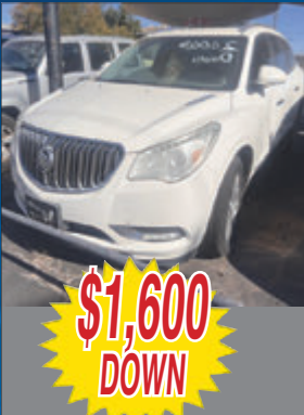
2014 BUICK ENCLAVE