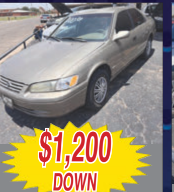
1999 TOYOTA CAMRY