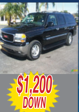
2006 GMC YUKON XL