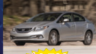
2008 MAZDA 3